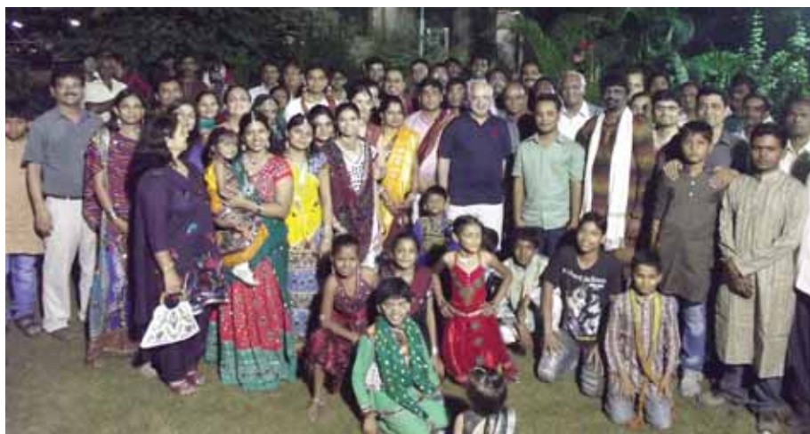
INFLIBNET Centre's Staff with their family members during the Garba Celebration at the INFLIBNET Centre