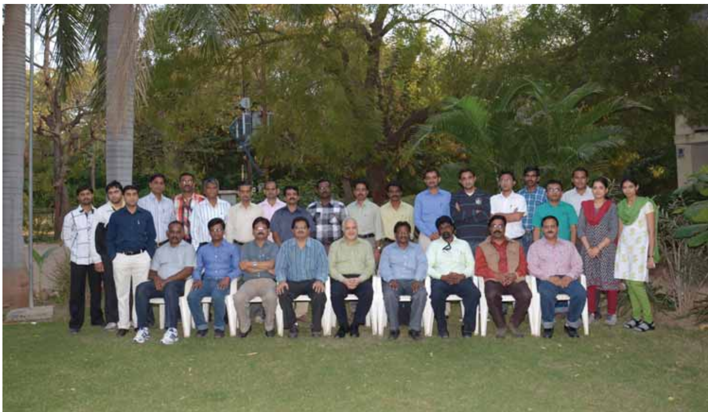
Participants of Creation and Management of Digital Collection with Director and Technical Staff of the INFLIBNET Centre