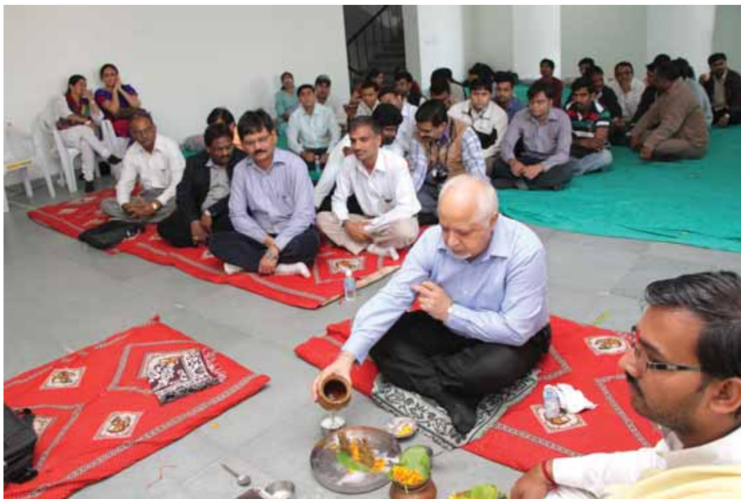
◀ Vastu Pujan @ Construction Site of the INFLIBNET Centre, Infocity, Gandhinagar