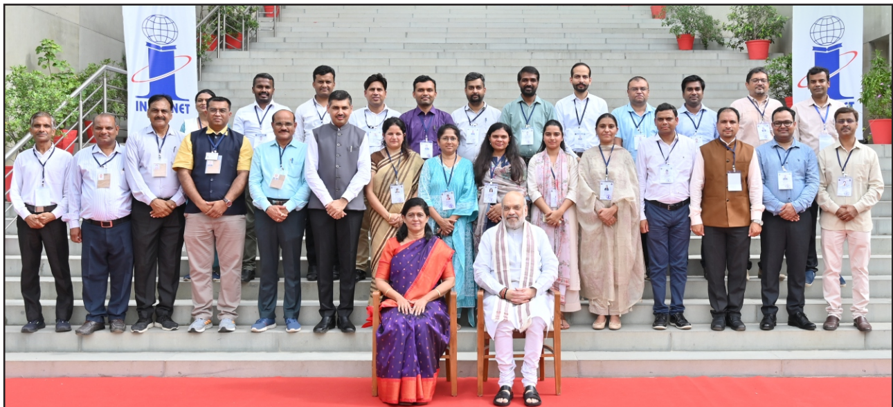
Figure-14: Visit of Hon. Governor of Uttar Pradesh, Smt. Anandiben Patel, 26 th June 2025