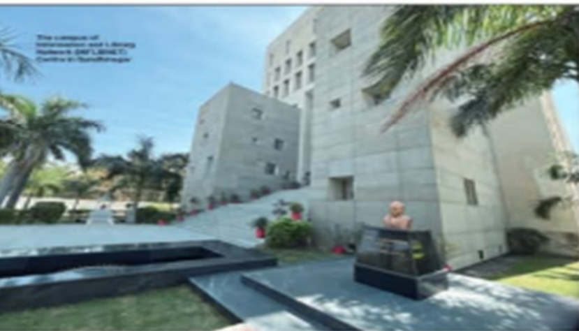
The campus of Information and Library Network (INFLIBNET) Centre in Gandhinagar