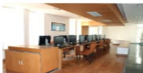
Resource Lab of Information and Library Network (INFLIBNET) Centre, Gandhinagar

INFLIBNET aims to establish communication facilities that improve the transfer of academic and research information, supporting scholarship, learning and research. It develops a nationwide computer-based network to link university libraries, colleges and research centres, increasing digitisation of books. The centre facilitates collaboration among researchers, faculty, and students through digital communication tools like email, file transfer and video-conferencing. It undertakes research and development in computer