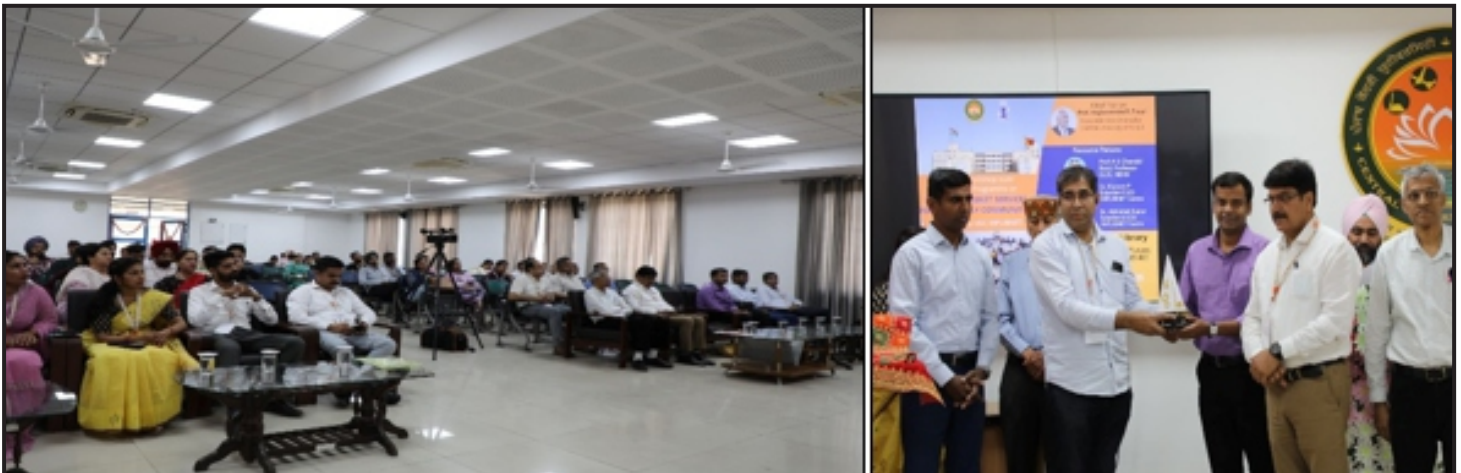
Figure-5: Glimpses from the Awareness Programme