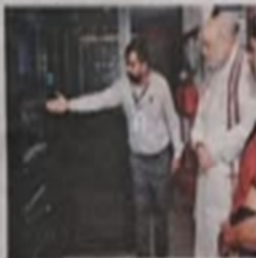
HM Amit Shah at INFLIBNET

Union Home Minister Amit Shah on Friday chaired the District Monitoring Committee meeting and reviewed the progress of various development works and the implementation of key central government schemes in the district. The schemes that were discussed included the Jan Dhan Yojana,