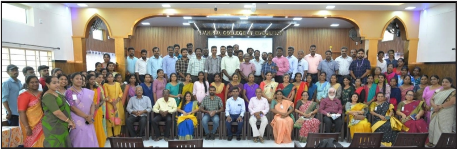
Figure-4: Group Photo of the Awareness Programme