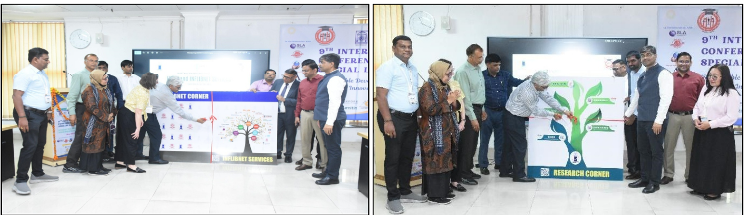
Figure-6: Release of Posters: Research Corner and INFLIBNET Services, at ICoASL-2025