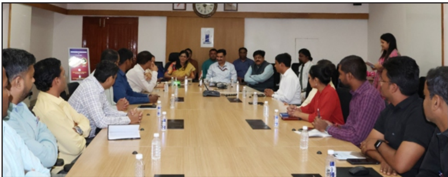
Figure-10: MoU Signing with CCRH, Ministry of Ayush