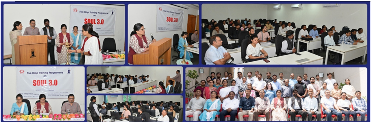
Figure-3: Some Glimpses from the Training Programme

The details of lectures delivered by staff members of the INFLIBNET Centre are as follows: