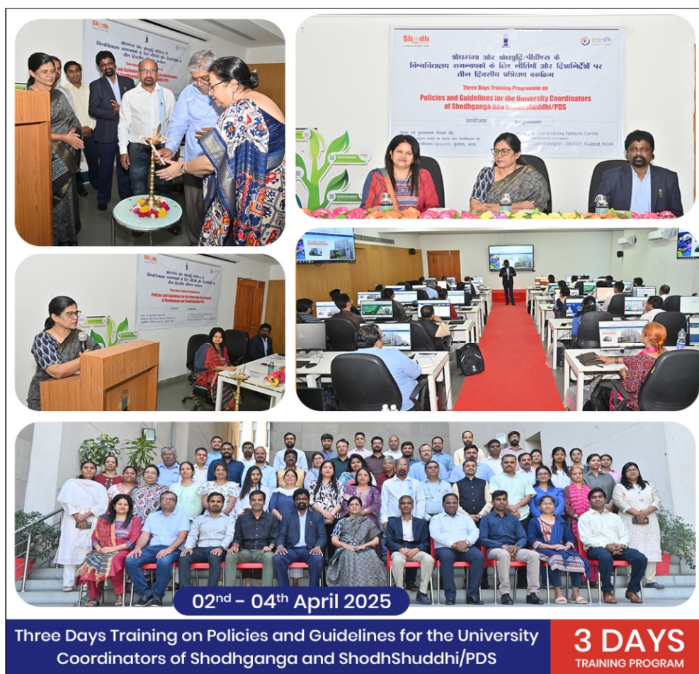
Figure-1: Some Glimpses from the Training Programme

and Institutes from India. In her inaugural address, she highlighted that the existing Shodhganga server has recently been fine-tuned, and the process of upgrading to a new server and migrating to the latest version is currently underway. She also outlined other services offered by the Centre and spoke about ONOS, which grants access to over 13,000 journal titles from 30 international publishers.