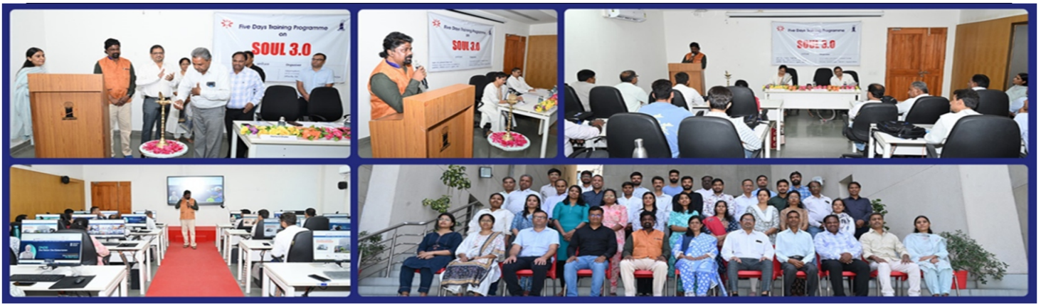
Figure-2: Some Glimpses from the Training Programme