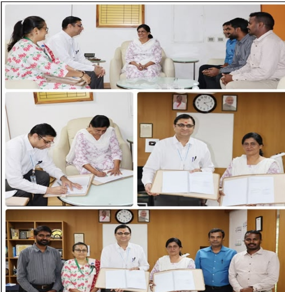
Figure-11: MoU Signing with Kadi Sarva Vishwavidyalaya, Gandhinagar