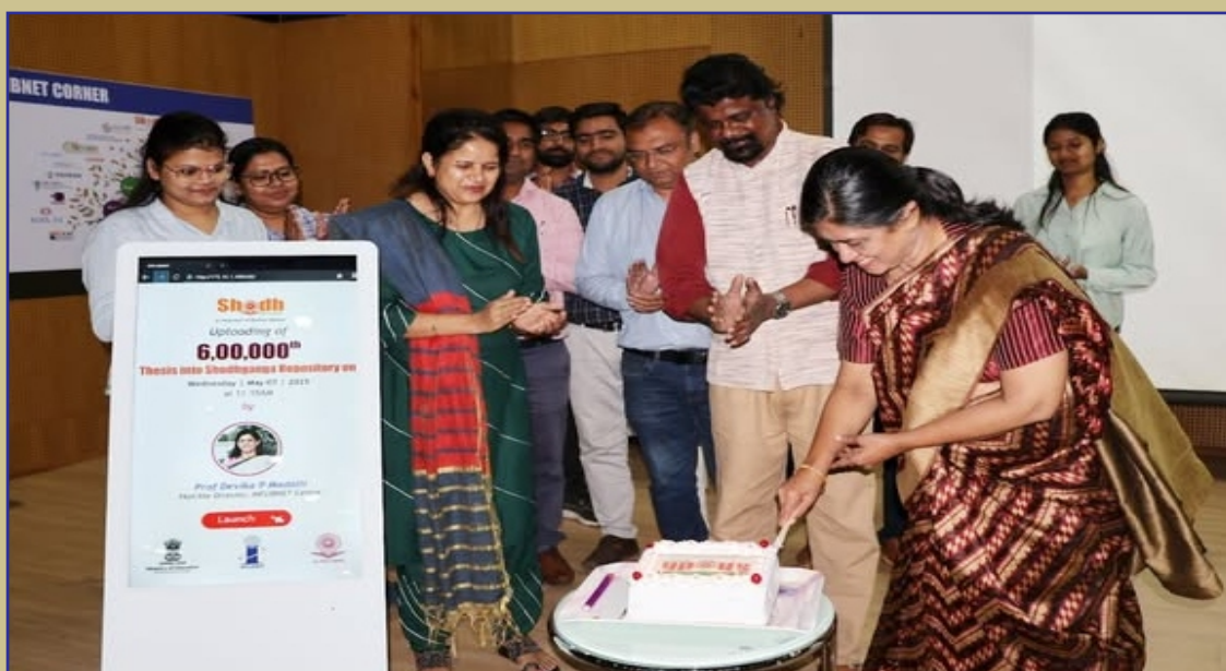
Figure-9: Celebration on reaching 6,00,000 Theses Submission on Shodhganga

Till 30 June 2025, (April 2025-June 2025), a total of 25 institutions (22 universities + 3 CFTIs/INIs) signed MoUs on Shodhganga with the INFLIBNET Centre, increasing the number of full-text theses in Shodhganga. During the reported period, the INFLIBNET Centre celebrated the remarkable milestone of reaching 6,00,000 theses on Shodhganga, a proud moment for the collective commitment and contributions of the academic and research community across the country. During the event, Prof. Devika Madalli, Director of INFLIBNET Centre, uploaded the 6,00,000th thesis into the repository on 07th May 2025 in the presence of all the INFLIBNET staff.