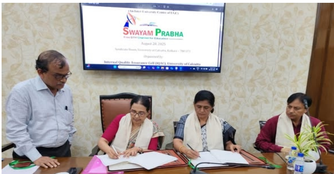
Figure-15: Glimpse from the MoU Signing Ceremony with the University of Calcutta

The University of Calcutta signed a MoU with the INFLIBNET Centre for SwayamPrabha: Free DTH Channel for Education on 20 th August 2025. The MoU signing event was organised by the IQAC Cell, University of Calcutta.