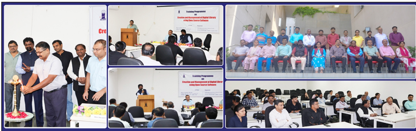
Figure-4: Glimpses from the Training Programme