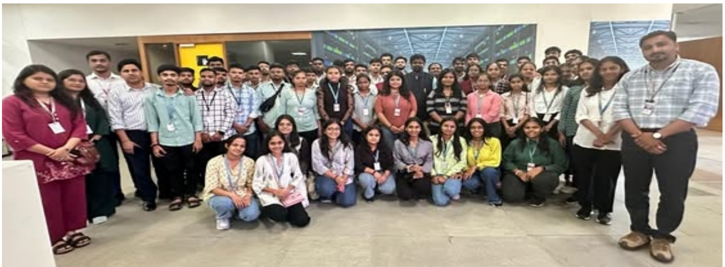
Visitors from the CSE & IT Department of S.N. Patel Institute of Technology, Bardoli