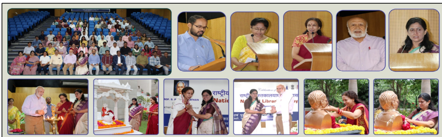
Figure-17: Glimpses from the Librarian's Day Celebration, on 12 th August 2025