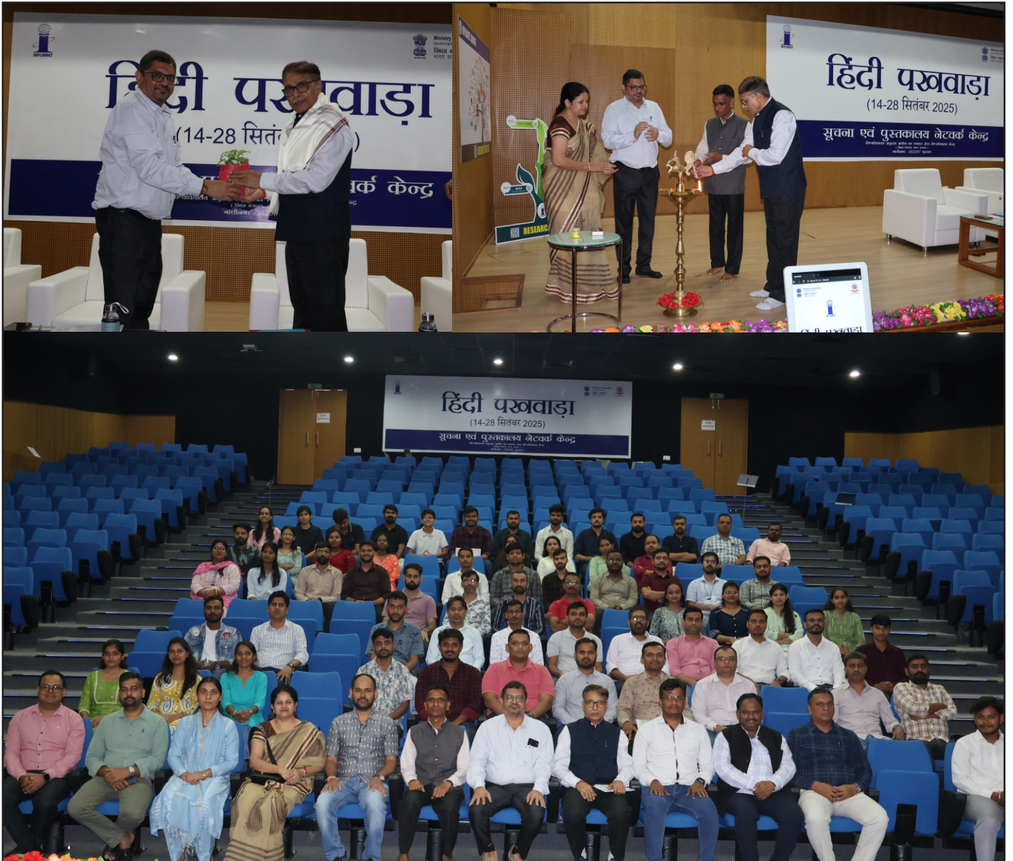
Figure-21: Glimpses from the Closing Ceremony of the Hindi-Pakhwada Celebration

कार्यक्रम में आयोजित विभिन्न प्रतियोगिताओं के विजेताओं को मुख्य अतिथि द्वारा पुरस्कृत किया गया। साथ ही, सभी कर्मचारियों ने हिंदी के प्रचार-प्रसार हेतु शपथ ली और हिंदी भाषा को बढ़ावा देने के प्रति अपनी प्रतिबद्धता को व्यक्त किया। कार्यक्रम का समापन राष्ट्रीय गान के साथ हुआ।