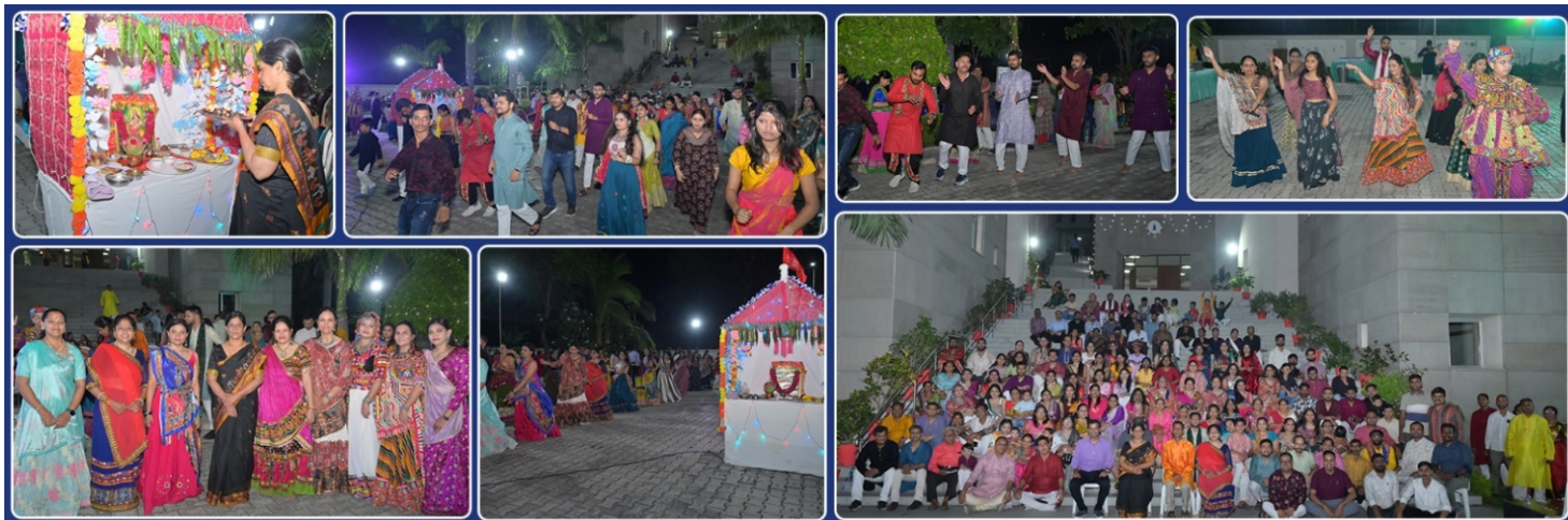
Figure-22: Glimpses from the Garba Night

The INFLIBNET Centre hosted a Garba Night filled with devotion, joy, and dance on 24th September 2025, to celebrate Durga Puja. The staff members and their families participated in it with great enthusiasm.