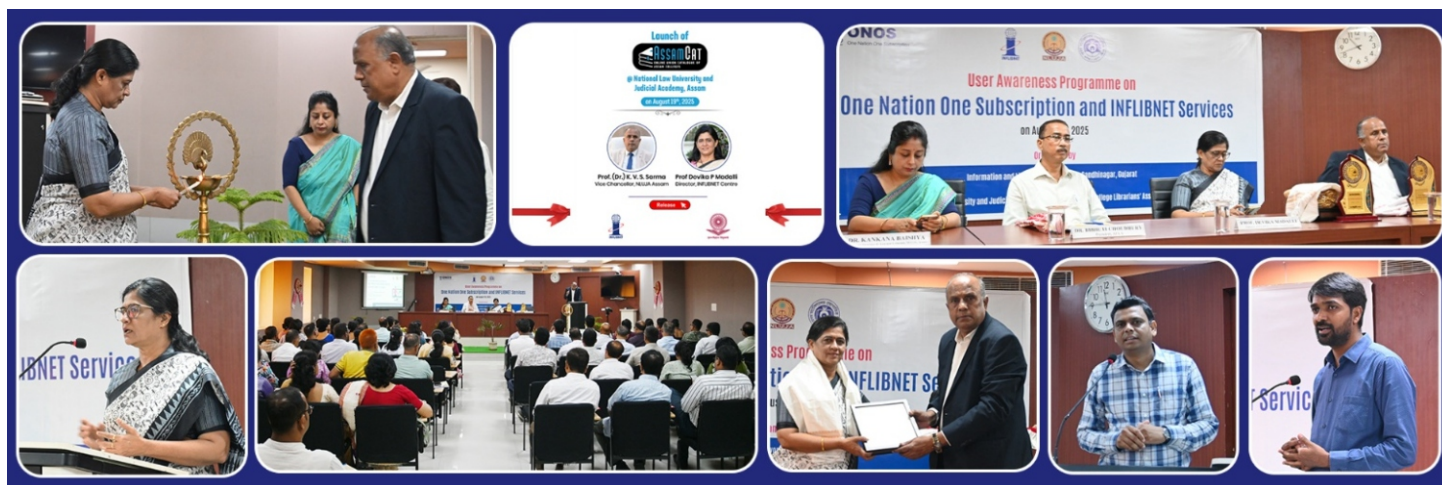
Figure-11: Glimpses from the Launching of AssamCat at NLUJA, Assam