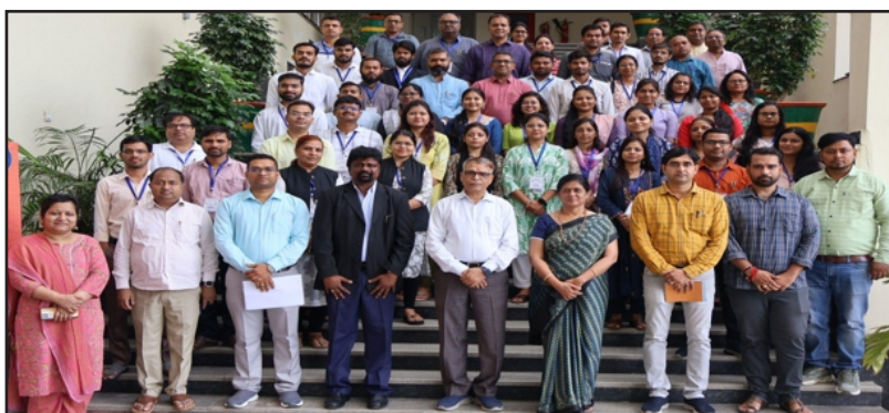
Figure-6: Glimpses from the Training Programme