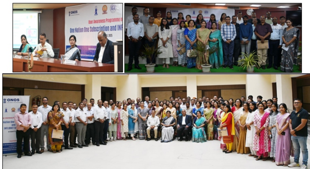
Figure-9: Glimpses from the ONOS Awareness Programme, NLUJA, Assam