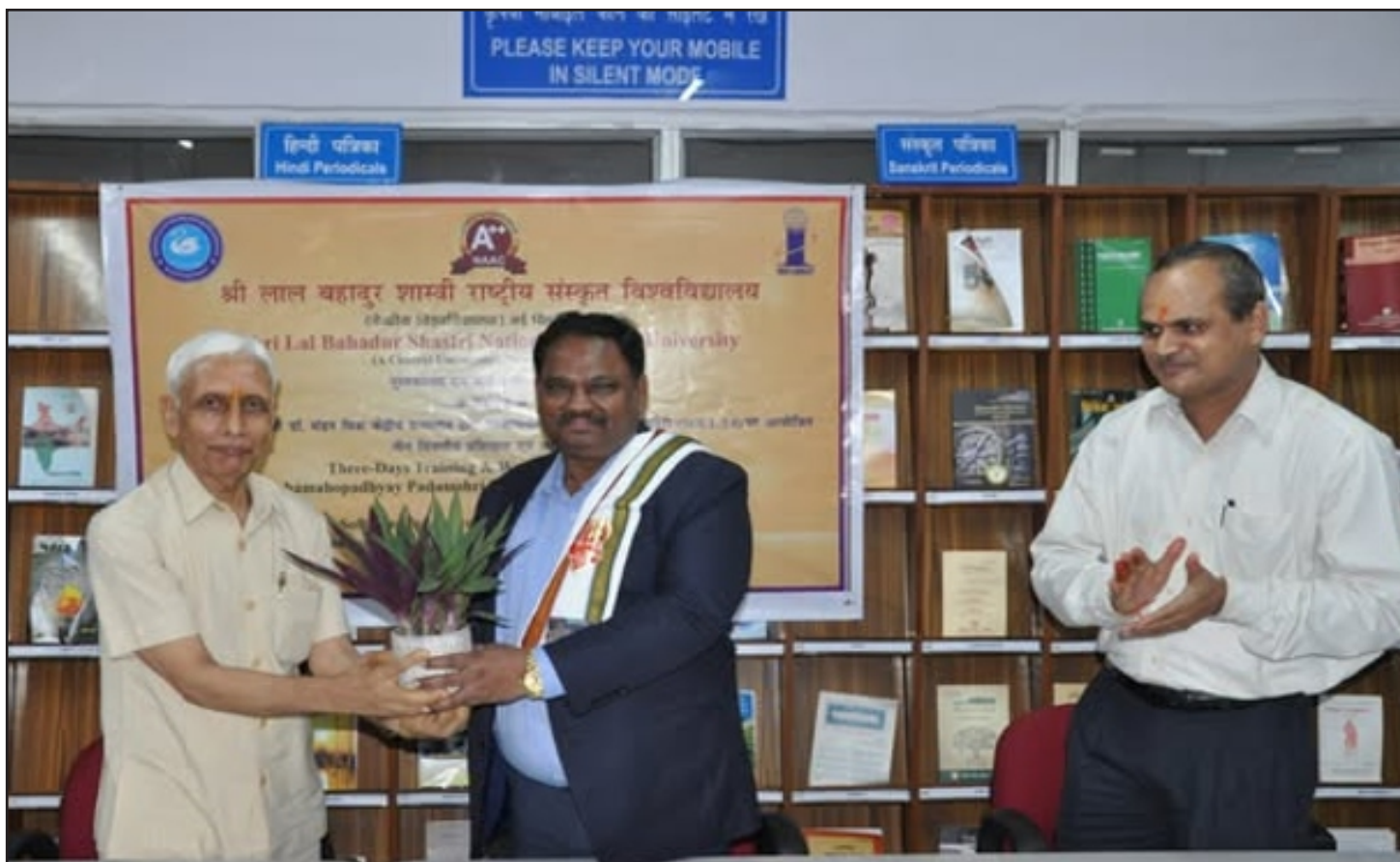
Figure-7: Glimpse from the Training Programme