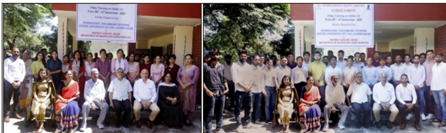
Figure-8: Glimpses from the Training Programme