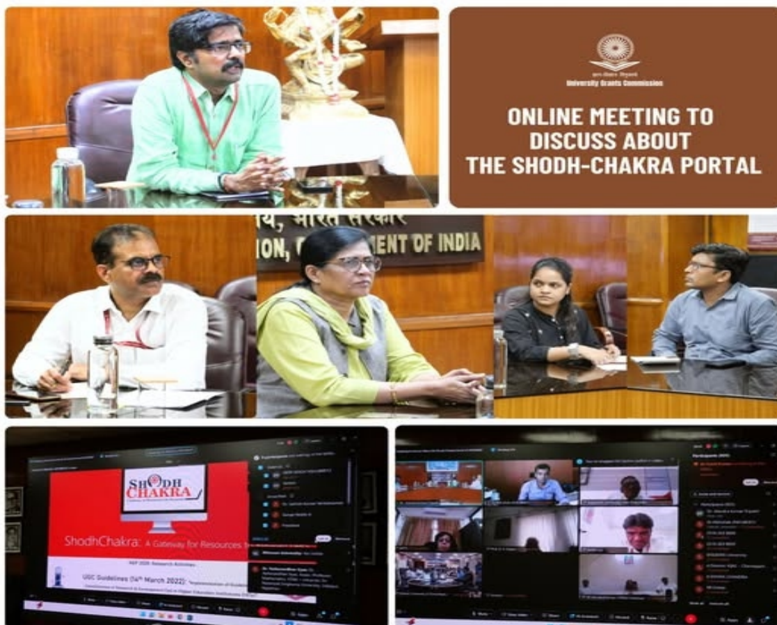
Figure-13: Glimpses from the Online Meeting on Shodh-Chakra