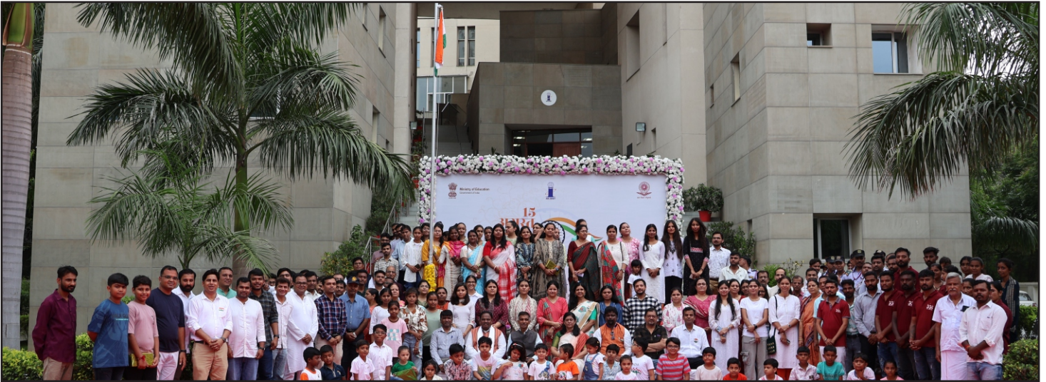
Figure-18: Glimpse from the Independence Day Celebration, on 15th August 2025

The INFLIBNET Centre celebrated the 79th Independence Day on 15 th August 2025 at the Centre with much pride and enthusiasm, in the presence of all its INFLIBNET Family members.