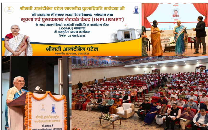
Figure-14: Glimpses from the MoU Signing Ceremony at KGMU, Lucknow

During the reported period, the INFLIBNET Centre officially signed a MoU with 38 State Public Universities and Higher Education Institutions of Uttar Pradesh, on 22 nd July 2025. The MoU signing ceremony took place at the Atal Bihari Vajpayee Scientific Convention Centre, King George's Medical University (KGMU), Lucknow, under the esteemed chairmanship of Smt. Anandiben Patel, Hon'ble Governor of Uttar Pradesh. This MoU signing marks a significant step toward strengthening academic and research infrastructure across all public universities and higher education institutions in Uttar Pradesh by facilitating seamless access to INFLIBNET's services and resources.