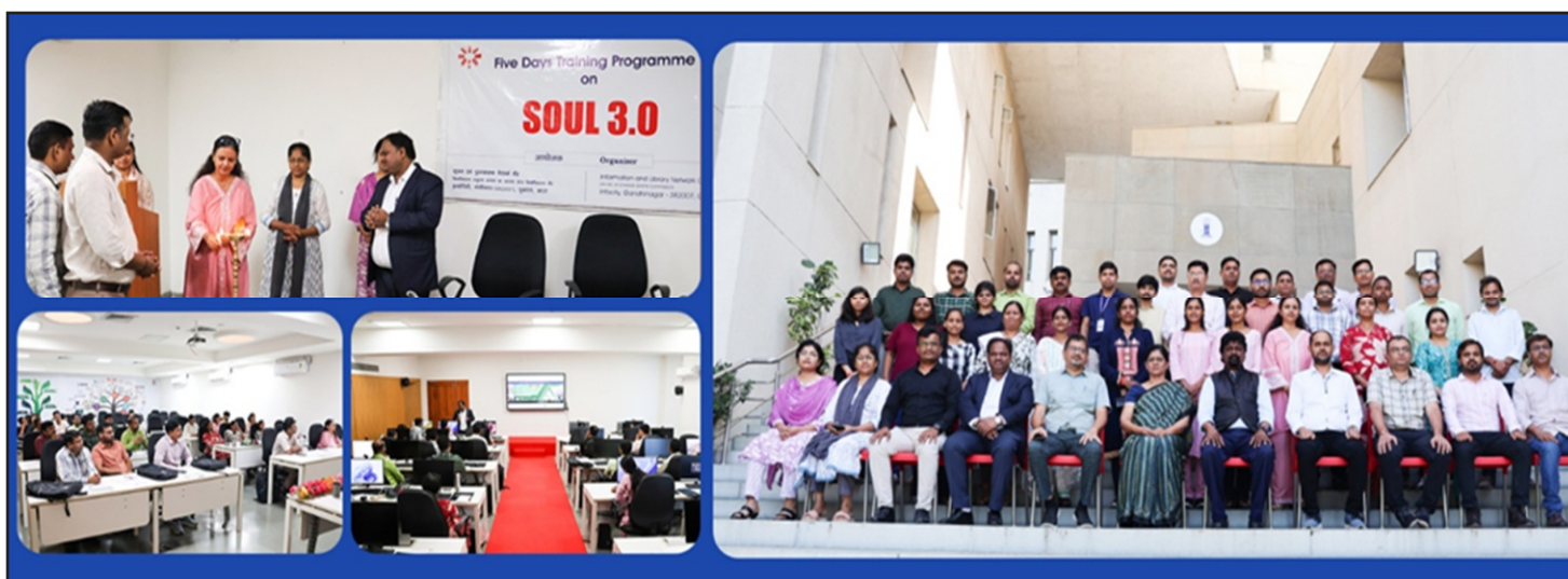
Figure-3: Glimpses from the Training Programme