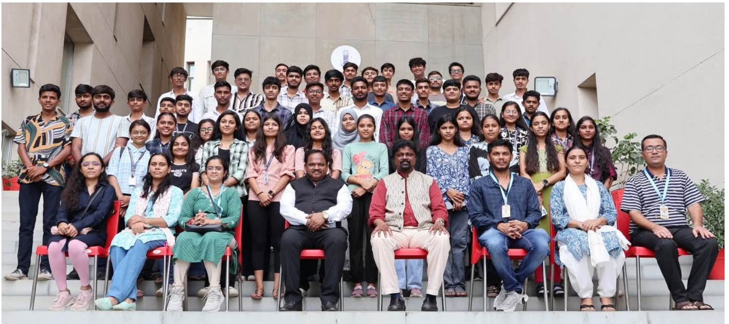
Visitors from the V.P. & R.P.T.P. Science College, Gujarat