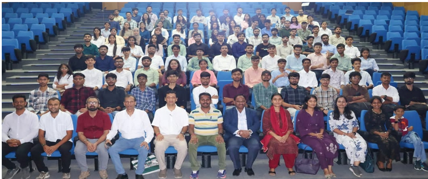
Visitors from the CSE & IT departments of Maharaja Sayajirao University of Baroda, Vadodara