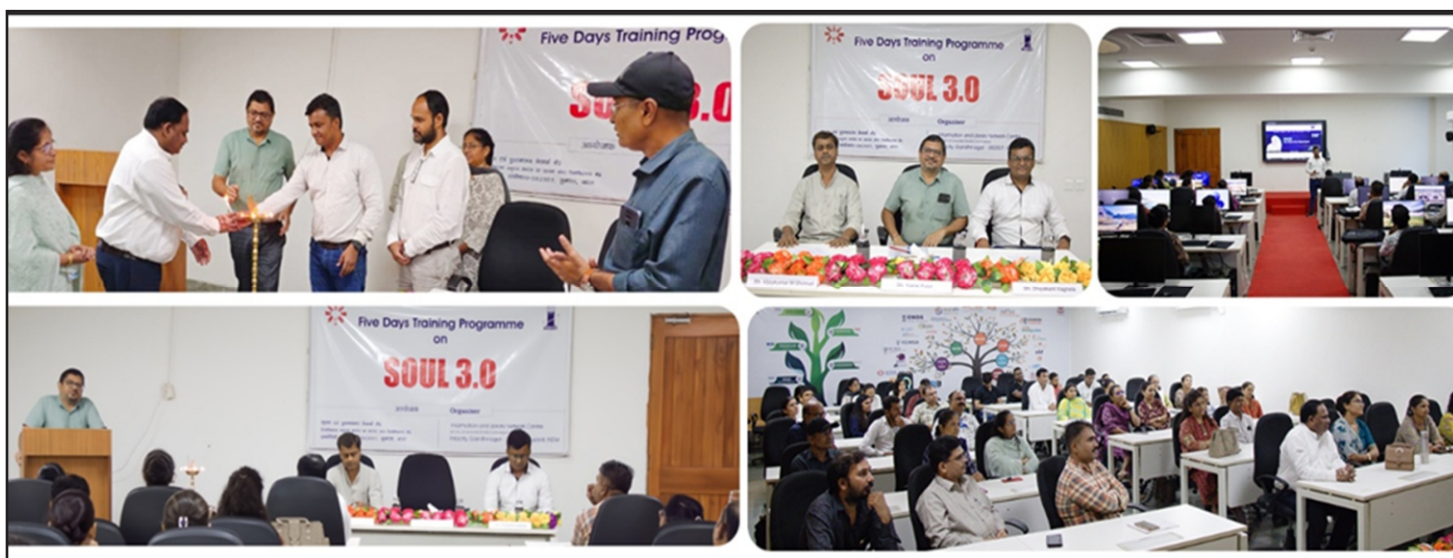
Figure-2: Glimpses from the Training Programme

The 177 th five-day training programme on “SOUL 3.0: Installation and Operations” was organized