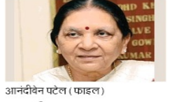
आनंदीबेन पटेल (फाल)