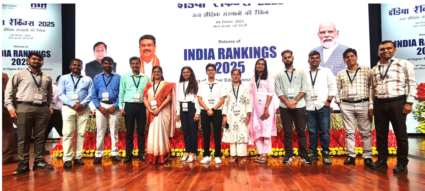
Figure-12: INFLIBNET Team at the India Rankings 2025