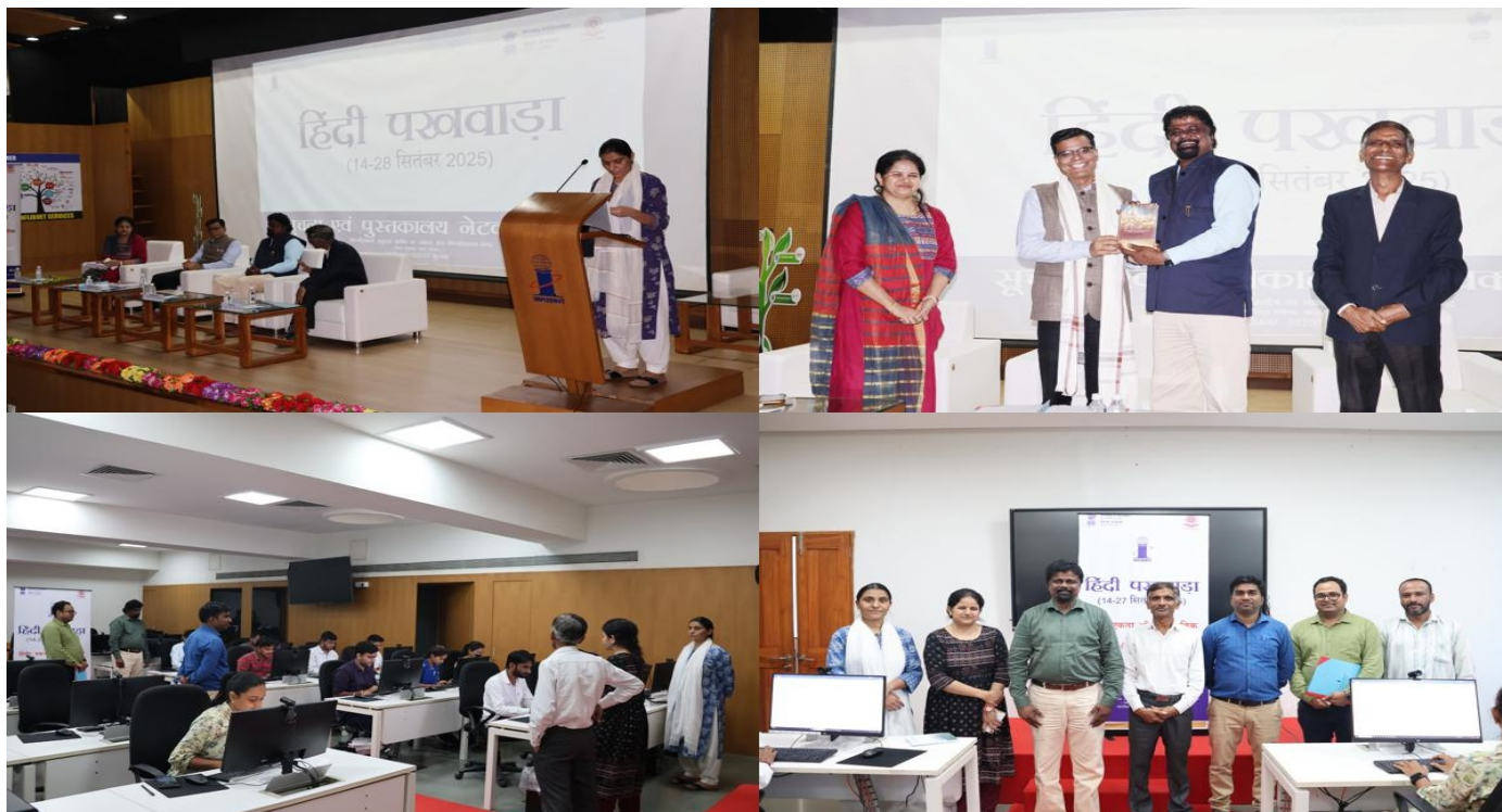
Figure-20: Glimpses from the Hindi-Pakhwada Celebration