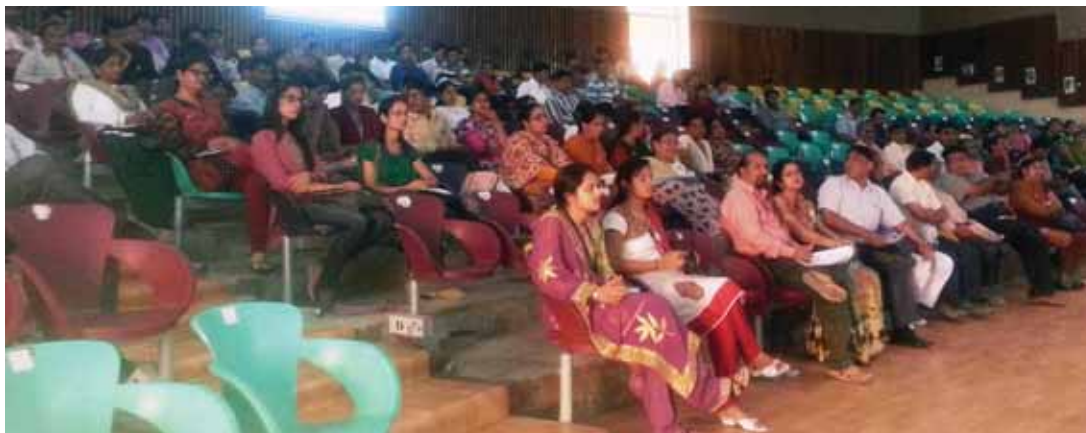
Participants of the User Awareness Programme on Shodhganga at Hemchandracharya North Gujarat University, Patan