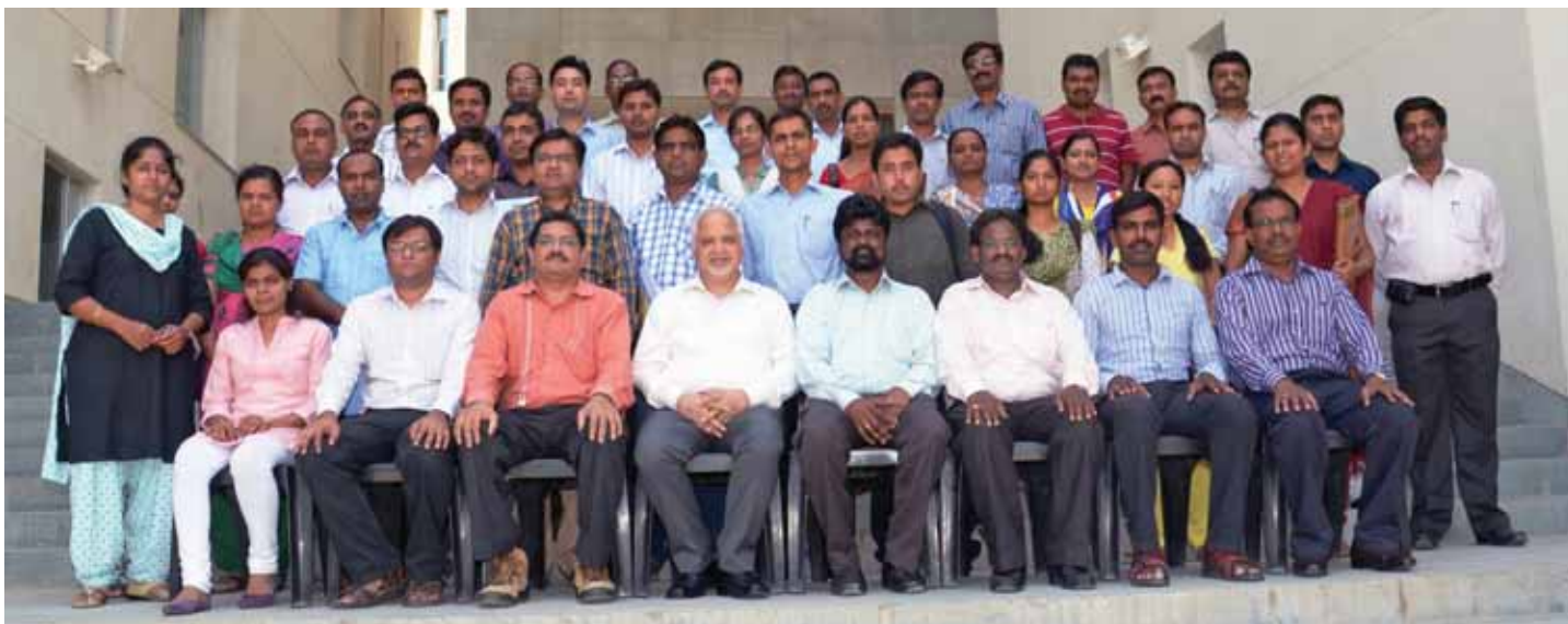
Participants of 107 th Training Programme on SOUL 2.0 with the Director and Technical Staff of the INFLIBNET Centre