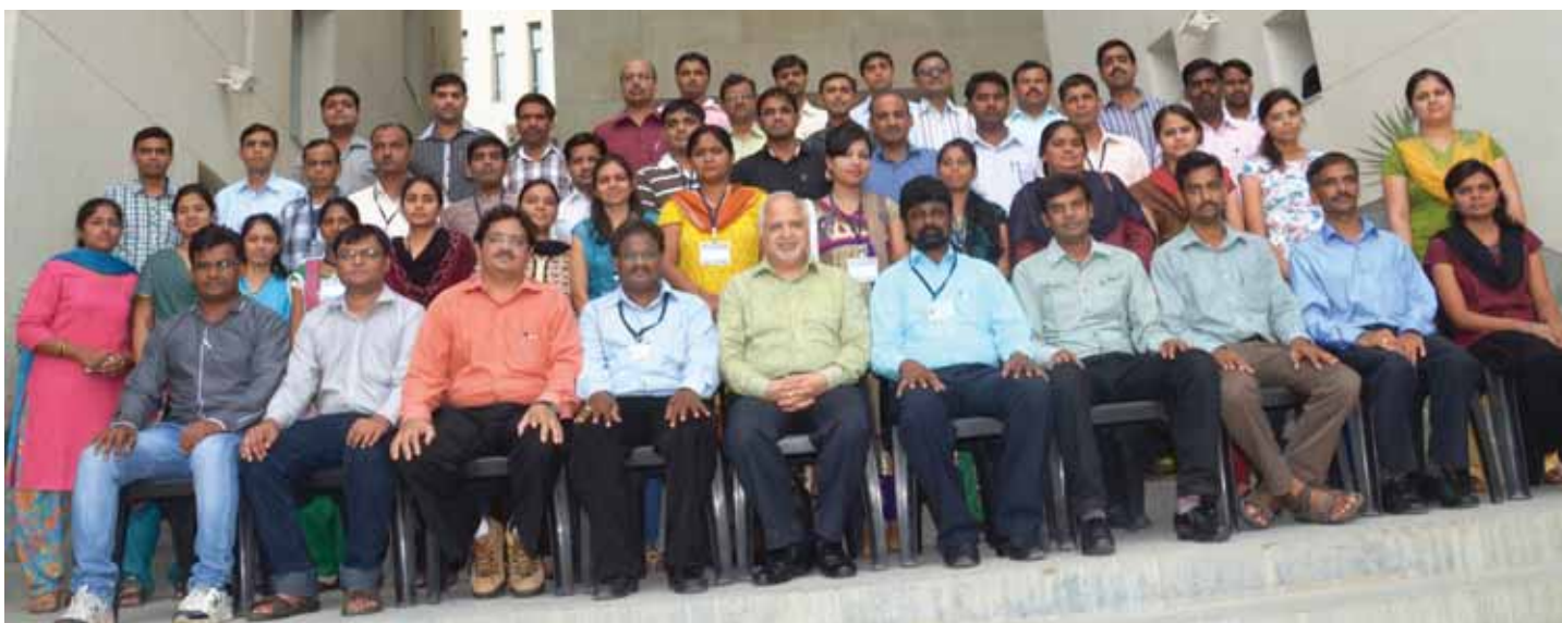
Participants of 106 th Training Programme on SOUL 2.0 with the Director and Technical Staff of the INFLIBNET Centre