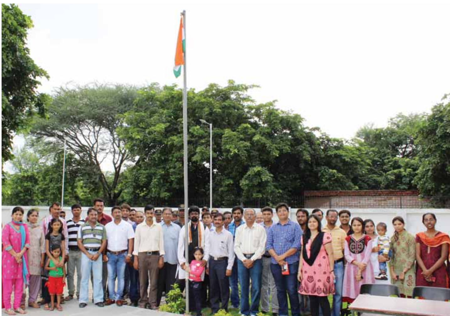
Independence Day celebration with staff members and their families at INFLIBNET Centre