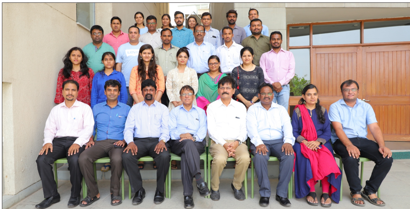
Participants of National Workshop on Metadata Standards: Retrospective Conversion, Preservation and Migration was organized at INFLIBNET Centre, Gandhinagar