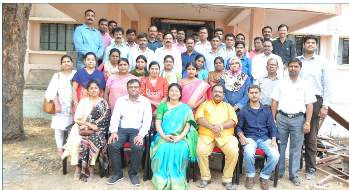
Participants of INFLIBNET Regional Training Programme on Library Automation (IRTPLA), Dr. Babasaheb Ambedkar Marathwada University, Aurangabad