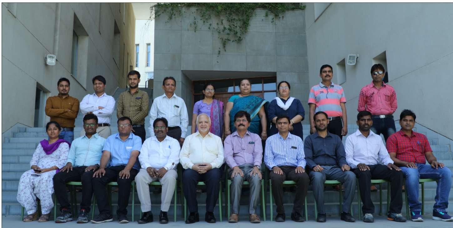
Participants of 140 th Training Programme on SOUL 2.0 with the Director and Technical Staff of the INFLIBNET Centre