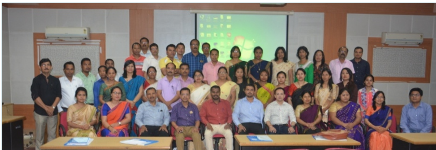
Participants of INFLIBNET Regional Training Programme on Library Automation (IRTPLA), Dibrugarh University, Dibrugarh, Assam

Besides training on SOUL 2.0 software, hands-on training was also imparted in other related fields of library automation and e-resource management using state-of-the-art facilities available in the LNB Library. Each participant was given a PC for effective and efficient training. Participants were given a programme kit consisting of study materials in CD/DVD format and printed lecture notes.