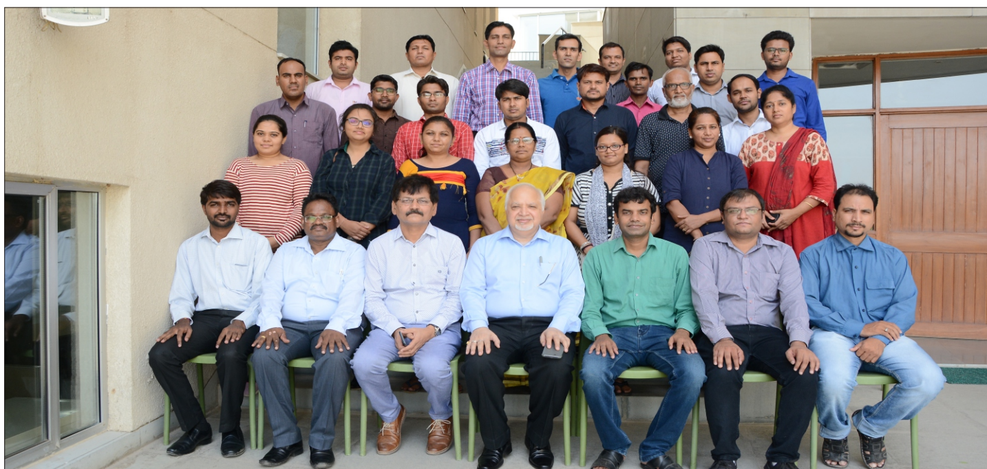
Participants of 141 th Training Programme on SOUL 2.0 with the Director and Technical Staff of the INFLIBNET Centre