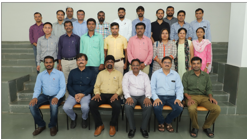
Participants of National Workshop on Federated Identity and Access Management (INFED) at INFLIBNET Centre, Gandhinagar