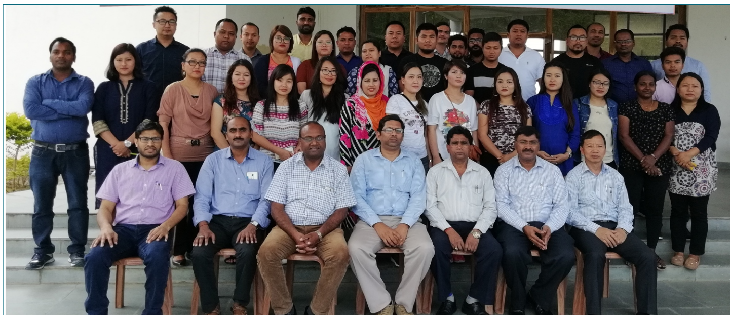
Participants of National Workshop cum Training Program on Research Ethics, Plagiarism and Reference Management, Mizoram University, Aizawl

Three-day National Workshop on Research Ethics, Plagiarism and Reference Management, Mizoram University, Aizwal, 11 th – 13 th April, 2018